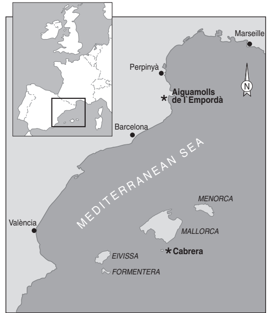
Figure 1. Map of the western Mediterranean showing the locations of the ringing stations used in this study.

For this study we analyzed data from two ringing stations, one located on the northeastern coast of the Iberian Peninsula (Aiguamolls de l'Empordà Natural Park) and the other on the small island of Cabrera at the Balearic Islands (Fig. 1). The continental station of Aiguamolls de l'Empordà (42°00'N, 3°00'E) is located at a marshy area which is dominated by Common Reed Phragmites australis . Cabrera (39°08'N, 2°56'E) is a small island located 10 km south of the large island of Mallorca and has a Mediterranean open-shrub vegetation with a small pine forest. Contrary to the mainland station, the island does not have marshy habitats. Data from the PPI is based on continuous and standardized mist-netting on Mediterranean islands and some mainland stations (Spina et al.