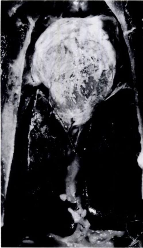
FIGURE 1. White, adherent, flake-like urate crystals on pericardium, air sacs and surface of liver. Note diffuse pinpoint white foci on liver.